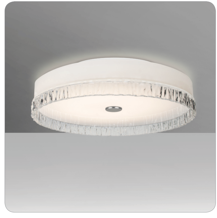
OPAL/CLEAR STONE (PACO12CLC)