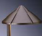
15315 AZT 15915 AZT6