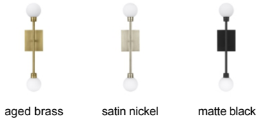
aged brass satin nickel matte black