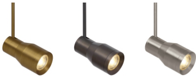
aged brass antique bronze satin nickel