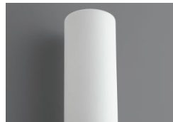
-1 White Opal Glass