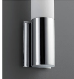
-14 Polished Chrome