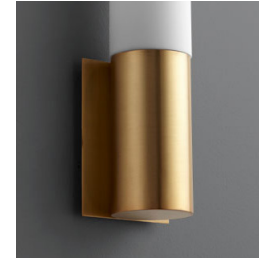
-40 Aged Brass