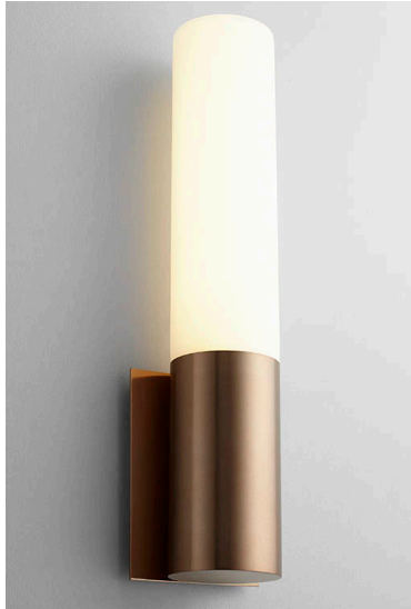
-25 Satin Copper