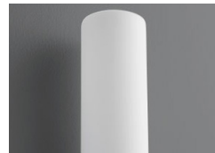
- Matte White Acrylic