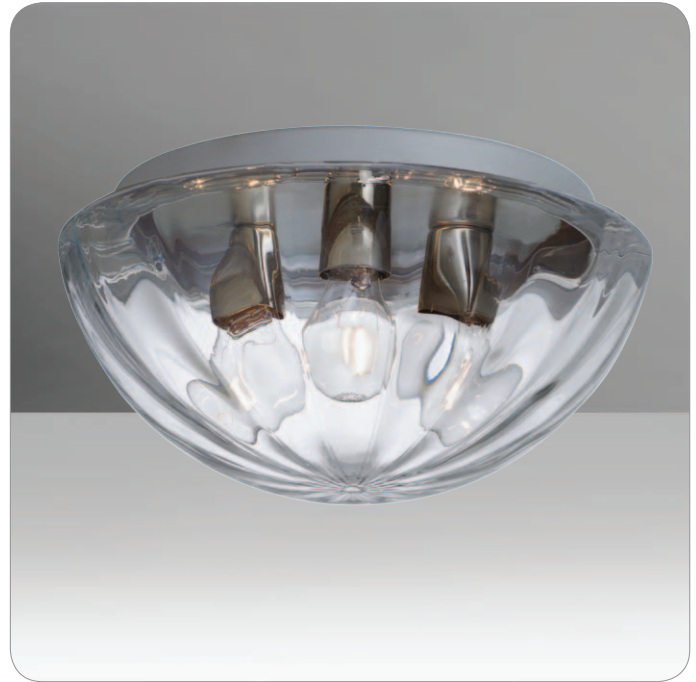
PINTA 15 CEILING SHOWN IN CLEAR (906388C)

UL or ETL Listed. Suitable for Damp Locations (interior use only).