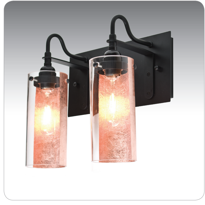
COPPER FOIL (DUKECF)

UL or ETL Listed. Suitable for Damp Locations (interior use only).