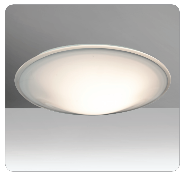
LUMA SLIM CEILING SHOWN IN OPAL GLOSSY/CLEAR

UL or ETL Listed. Suitable for Damp Locations (interior use only).