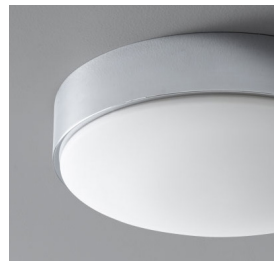
-14 Polished Chrome