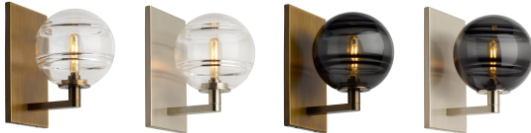
clear / aged brass