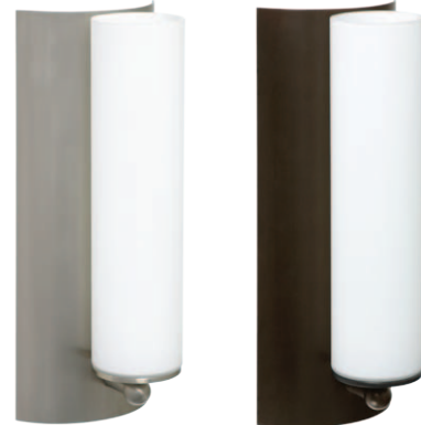
OPAL MATTE, BRONZE