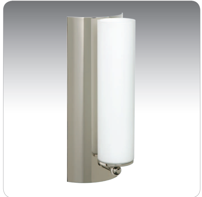
METRO SHOWN IN OPAL MATTE, POLISHED NICKEL (1WE-118607-PN)