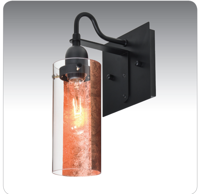
COPPER FOIL (DUKECF)

UL or ETL Listed. Suitable for Damp Locations (interior use only).