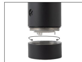
Continuously Adjustable Beam Angles Indexed at 35°, 45°, 55°