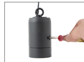
Select Warm White, Pure White, or Cool White (2700K, 3000K or 4000K)