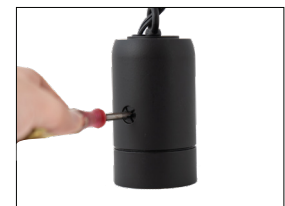
Continuously adjustable brightness